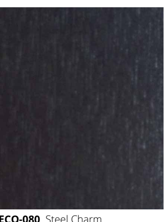
ECO-080 Steel Charm