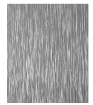
ECO-2000 Silver Hairline