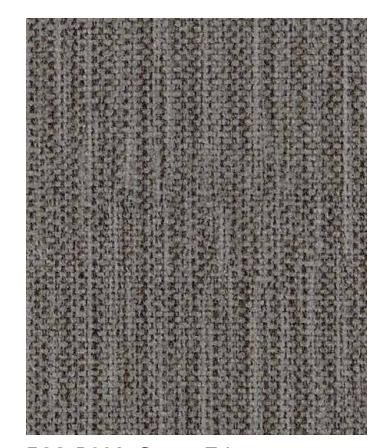
ECO-P098 Creme Tris